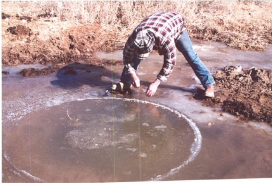
Photo 5. Investigator collected ice-shavings into a 50 ml BlueMax Tube.