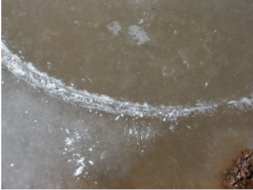
Photo 4. Ice shavings were visible in and near the groove, suggesting the circle had been carved, not melted into the ice.