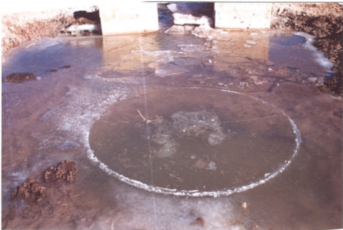
Photo 1. Location of the ice-circle and proximity to the irrigation head gates (compare with map below).

In order to see if any unseen chemical or material evidence had been left in or around the circle, it was decided to chemically analyze the ice from the groove itself. Three to four grams of the shavings were collected from close to and within, the circumference of the circle. Shavings were collected into a 50 ml sterile Falcon BlueMax tube (see Photo 5). Similar quantities of ice were collected into separate sterile tubes from the center of the circle and from an area of ice about 100 feet away from the circle. The latter sample served as a control.