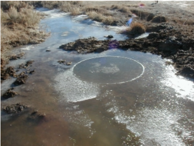
Photo 3. Regions of blown frost and snow surrounded the ice-circle.